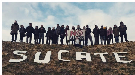
Figure 5: the "SUCATE" sign.

unsuitable and of the indecent, of the desirable and of the repulsive, all of which reverberates sympathetically with what Larissa Pelúcio's describes as Teoria Cu (PELÚCIO, 2014). 21 In their performatic act, Sicilian activists are literally inviting the Americans to have sex with them, and by doing this they reposition the terms of the debate from the domains of warfare and court litigation to that of sexual intercourse/domination. Pelúcio attempts to "go beyond translating 'queer', towards thinking of a theory informed by [the] productions [of North American and Northern European queer theorists], but which also dares to invent itself through questioning our own marginalized experience" (2014, p. 1): while Pelúcio seeks to account for Latin America, I see the exercise of Teoria Cu as applicable to marginalised Southern European communities such as Sicily. In general, queer speech-acts from global peripheries cannot be separated from a passionate decolonial politics of identity, as the SUCATE signs brilliantly exemplifies.