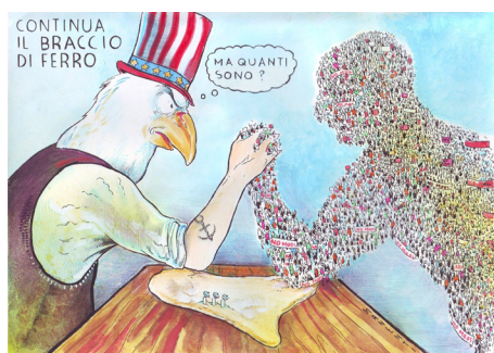
Figure 12 – Guglielmo Manenti, 2013 (reproduced with kind permission of the author)

The strip displayed in Figure 10 shows an arm wrestling match between an eagle-shaped Uncle Sam and a crowd of protesters shaped as a giant. The general caption reads: "The tug of war continues" 24 , while Uncle Sam nervously wonders: "How many of them are there?"