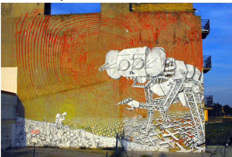
Figure 11 - Blu's street art in Niscemi (reproduced with kind permission of the author).

than the monster, and the work obviously displays and reproduces the immense power imbalance between the parties involved in the dispute. At the same time, this imbalance is implicitly suggesting a great deal of heroism in the grassroots struggle against the MUOS.