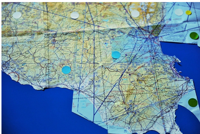
Figure 10 -Map excerpt from Rapicavoli's A cielo aperto (reproduced with kind permission of the author).

The very act of exhibiting in the US work that is critical of US militarisation of Sicilian territory represents undoubtedly an important statement. Rapicavoli implicitly subverts the normativity of US-produced (or US-influenced) discourses about the strategical priorities of Sicilian territory by staging her own counter-discourse precisely within a US-based art venue, which, regardless of any liberal narratives it might foster, can nevertheless be described as a locus of reproduction of national power discourses. This subversion of both the subject of the discourse and the place of the discursive intervention could be seen as