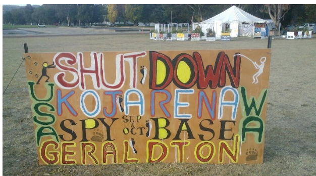
Figure 15: Protest sign against the Kojarena-Geraldton MUOS base outside the Aboriginal Tent Embassy.

The sign in Figure 15 might well represent only a limited and marginal part of the protest against the Kojarena base, but it is certainly understood that US military presence in Western Australia is mediated by an illegitimate Anglo-White government that has seized Aboriginal sovereignty by means of genocide and racial subjugation.