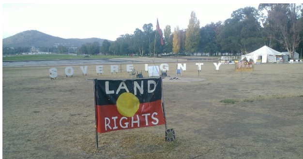
Figure 14: Banners and signs demanding sovereignty outside the Aboriginal Tent Embassy in Canberra, Australia

Among these various protest signs, I noticed a banner that advocated precisely the closure of the Kojarena-Geraldton “spy base” that hosts the MUOS Ground Station (Figure 15). In Australia, the protest against the MUOS Ground Station is indissolubly linked with the repossession of usurped Aboriginal sovereignty.