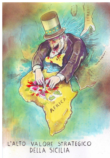
Figure 13 - Guglielmo Manenti, 2013 (reproduced with kind permission of the author)

does not refrain from exposing the US foreign defence policies as a perverse global hegemony agenda: