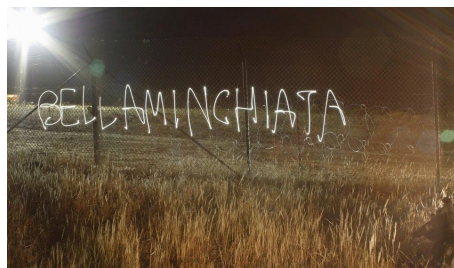
Figure 7: The second, successful attempt to deliver the “Bella Minchiata” message, in May 2016 (reproduced with kind permission of the Bella Minchiata group)

unsuccessful attempt, Bella Minchiata returned to the MUOS site and managed to excogitate a way to avoid attracting the attention of the authorities and deliver their “love message” (BELLA MINCHIATA, 2016b) to the MUOS: this was done by setting the camera to long exposure, and “air-writing” the phrase with a lamp (Figure 7). This artifice may only be appreciated in the photo, but it is still an impressive achievement in the face of the disproportionate militarisation of the site.